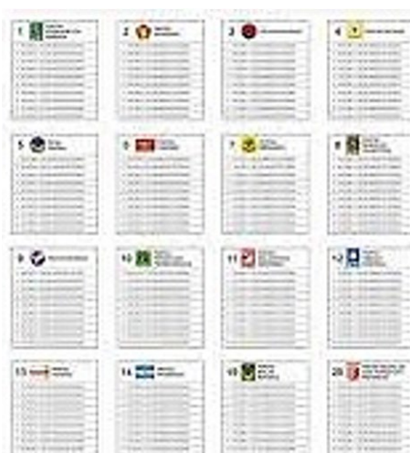
Figure 3. 2019 model of the legislative election papers (central people's representative council-DPR-yellow label, provincial regional people's representative council-DPRD 1-blue label, and regency/city regional people's representative council-DPRD 2-green label).

The problem of the 2019 general election with lots of election papers can be overcome by simplifying the number and model of election papers the legislative election papers (central people's representative council, provincial regional people's representative council, and regency/city regional people's representative council), as shown in the following Figure 3: