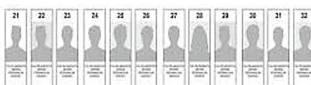
Figure 2. 2019 regional representative council election paper-red label.

Next is the election paper for the regional representative council as in the Figure 2 below: