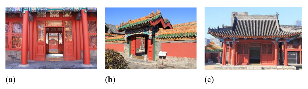
Figure 2. Decoration features of different parts of the ShengJing Imperial Palace building (a) door and window decoration 1, (b) door and window decoration 2, and (c) door and window decoration 3.