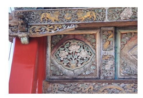
Figure 8. Qing Dynasty Color Painting Original Appearance

many parts of the Shengjing Imperial Palace, the original appearance of the very precious Qing Dynasty color paintings is preserved (Figure 8). The theme of this color painting comes from the respect and love of nomads for natural plants. Such color characteristics are very consistent with the color styles in most buildings in the Manchu and Mongolian ethnic areas of China (Guangquan, 2002). Because of the color used in this kind of color painting, this kind of color painting can give people a strong feeling of prosperity. The value of color information carried by such color paintings relates to the color intention reflected. All colors express visual information; in a narrow sense, color undertakes the task of conveying images.