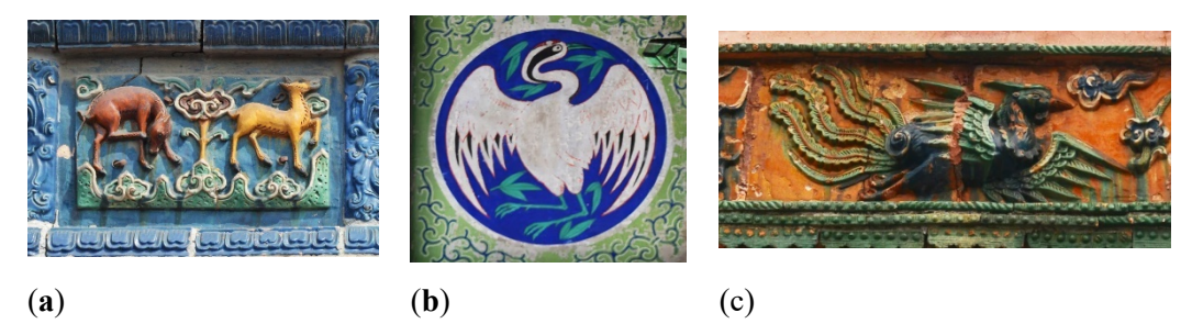
Figure 6. The decorative pattern of the ShengJing Imperial Palace architecture (a) pattern of animal 1, (b) pattern of animal 2 and (c) pattern of animal 3.

However, the two early buildings in the east and middle courtyards of the Shenyang Imperial Palace did not adopt the highest-grade roof form. They use the current form to follow the camping tents that the