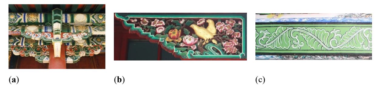
Figure 5. The decorative pattern of the ShengJing Imperial Palace architecture (a) pattern of plants 1, (b) pattern of plants 2, and (c) pattern of plants 3.