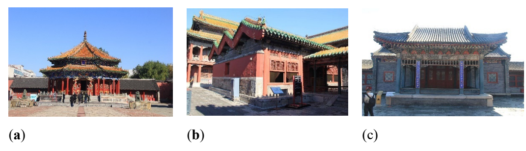
Figure 1. Decoration features of different parts of the ShengJing Imperial Palace building (a) roof decoration 1, (b) roof decoration 2, and (c) roof decoration 3.

In the static concept, the image of architecture refers to the external expression image produced by people's idea, concept, or image scene through the architectural form (Pallasmaa, 2011). The external form of the building is an image, an image form of the architecture (Degen et al., 2017). In dynamic activities, the interaction between people and architecture stimulates the image and is endowed with the consensus meaning and emotional connotation of the creator and the recipient. Keswick (2003) and Wang (2016) mentioned that a Chinese architectural theorist explained the meaning of architectural image and architectural artistic conception. Image refers to the affection of intention and interest. Image has two states: The first is the image of the object (natural or person). It is the object of objective existence; the second, it is the image formed by the perceptual perception and the conception in the mind of the subject (Wang, 2022; Youbin, 2009).