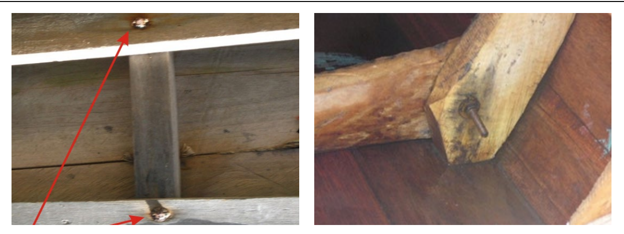
Figure 5. Bolts or Nails that Rust Easily.

Install motor drive tubes and rubber pipes where low-quality materials are used. Figure 6 shows the installation of motor drive tubes and rubber pipes.