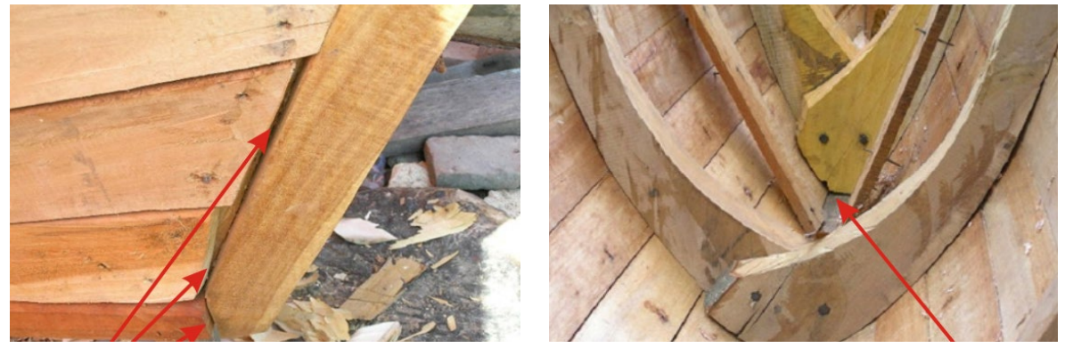
Figure 4. Mismatched Connections.

• Incompatible and carefulness when making parts connections, worker experience and thoroughness are very important in this process. Figure 4 shows mismatched connections.