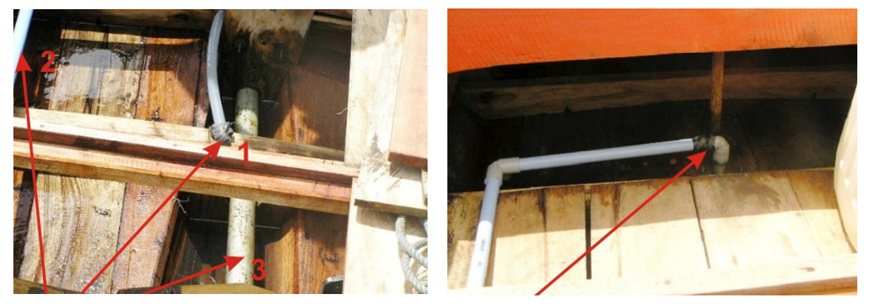
Figure 6. Installation of Motor Drive Tubes and Rubber Pipe.

Install motor drive tubes and rubber pipes where low-quality materials are used. Figure 6 shows the installation of motor drive tubes and rubber pipes.