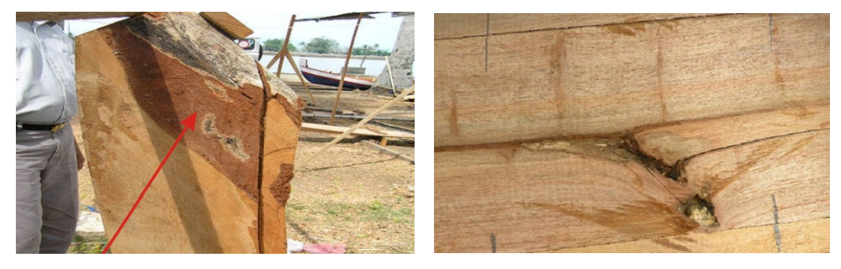
Figure 3. Poor Quality Wood.

• The wood quality does not meet the requirements, namely when the wood drying process is not perfect and there are wooden knots that can cause gaps during assembly. Figure 3 shows the poor quality of the wood.