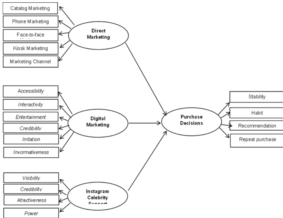
Figure 1. Research Framework

Based on the above model, so this research uses the Smart-PLS analysis tool with the following research hypotheses: