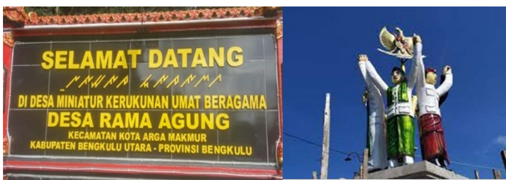
Figure 1. Welcome Gate and Religious Harmony Monument of Rama Agung Village

Interreligious harmony is built into inter-religious dialogue. In order to be communicative and avoid theological debates between religious believers, religious messages that have been reinterpreted in harmony with the universality of humanity become the capital for creating harmonious dialogue in diversity.