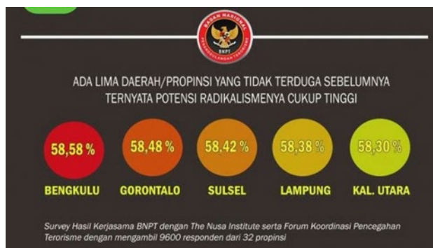
Figure 2. BNPT Survey 2019

Interreligious harmony is built into inter-religious dialogue. In order to be communicative and avoid theological debates between religious believers, religious messages that have been reinterpreted in harmony with the universality of humanity become the capital for creating harmonious dialogue in diversity.